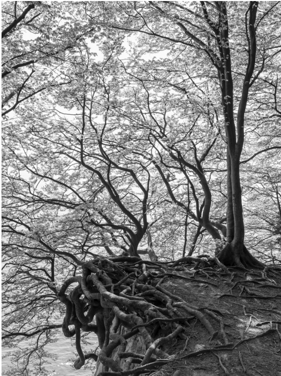
Graubaum 68, 2023